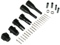
U006-0028 Cable connector kit